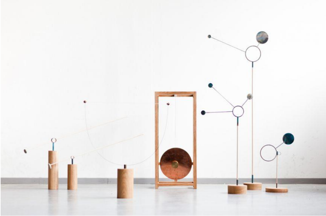
Collective Design. Kneip. "Weathered," 2015 Functional sculptures. Kneip