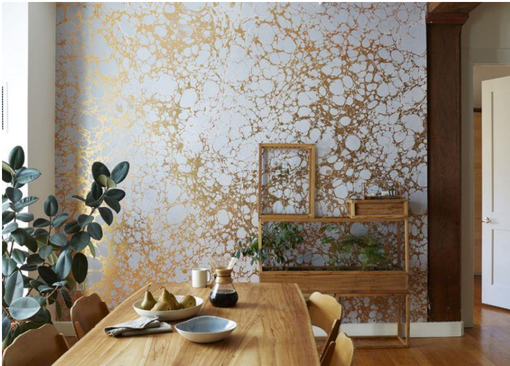
Collective Design. Calico Wallpaper.