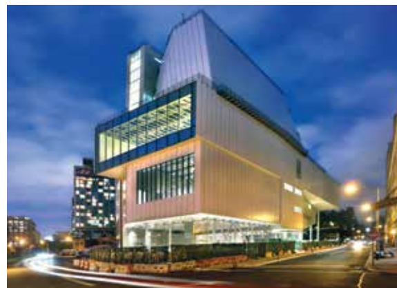
CLOCKWISE FROM LEFT: NEIL BICKNELL AND GALLERIE GOSSEREZ, PARIS; PLENSA STUDIO BARCELONA; ED LEDERMAN

On May 1, the Whitney Museum of American Art unveils its new, 200,000-square-foot Renzo Piano-designed building in the Meatpacking District. Founded by Gertrude Vanderbilt Whitney in 1930, the peripatetic institution had outgrown its most recent home on the Upper East Side, its permanent collection having swelled from some 2,000 works at the time the Marcel Breuer building opened in 1966 to more than 21,000 today. Among the new Whitney's most notable features is an 18,000-square-foot fifth-floor exhibition hall, the largest column-free gallery space in New York City. Its inaugural show will celebrate the richness of American art since 1900, with an exhibition drawn from the museum's permanent holdings. —AMHS